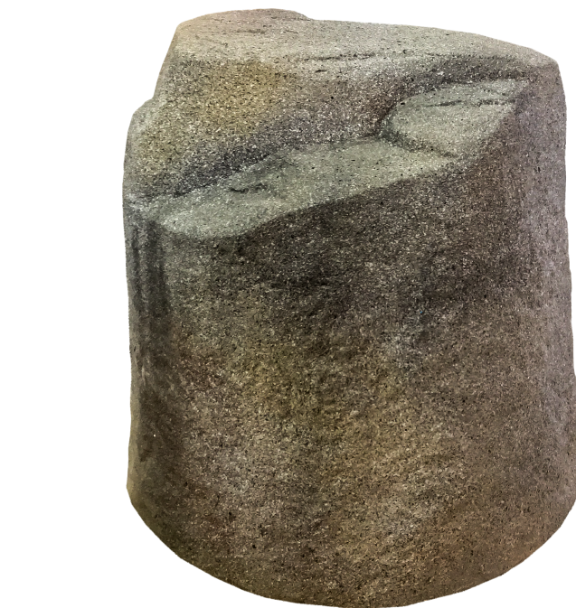
4 Typical Rock Stepper