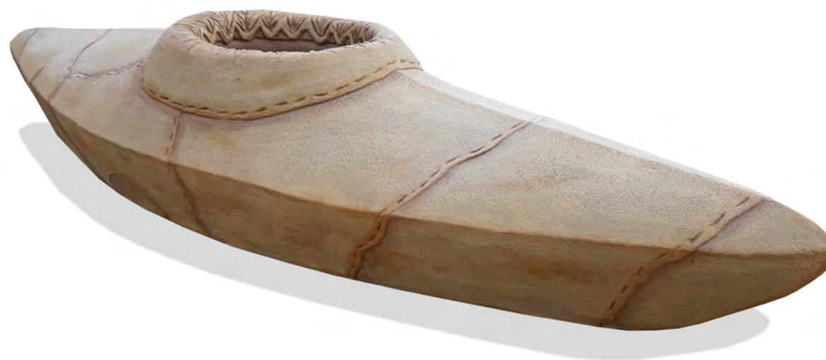
3 Arctic Kayak_SC047