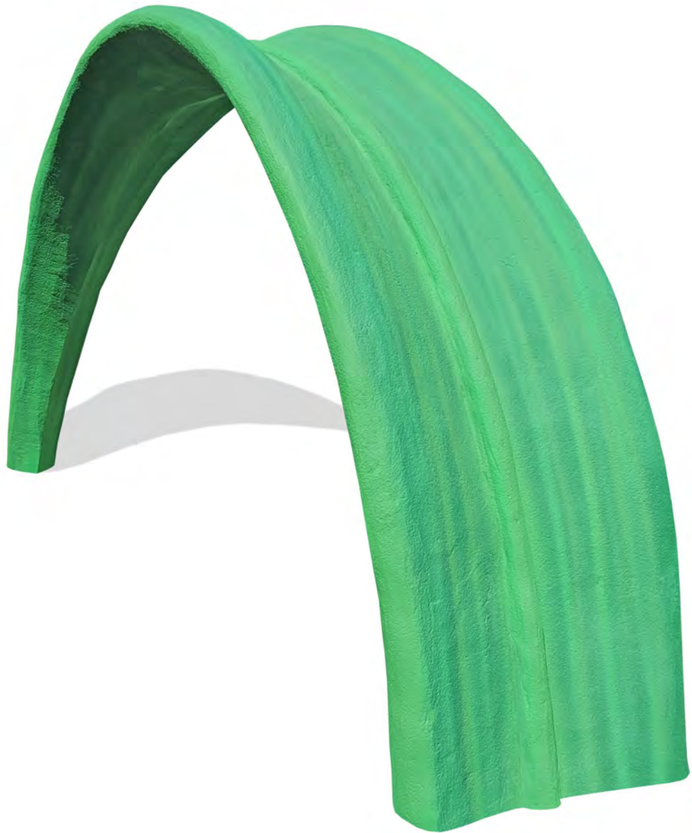
3 Grass Blade LRG_SC019