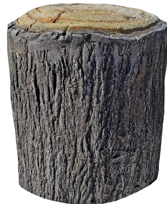
4 Typical Log Stepper