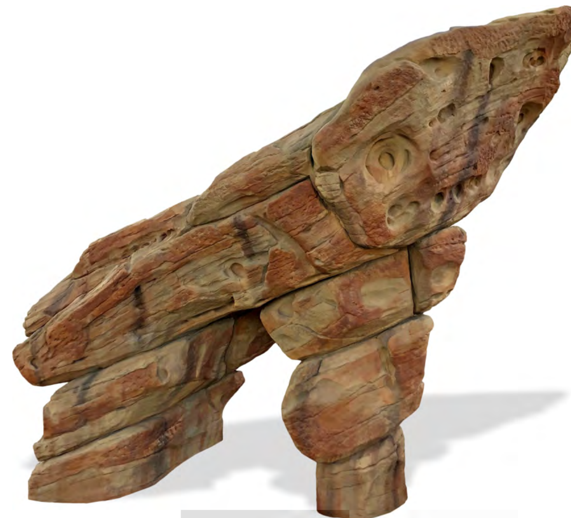
3 Pagosa Boulder_PB006 (Sandstone)