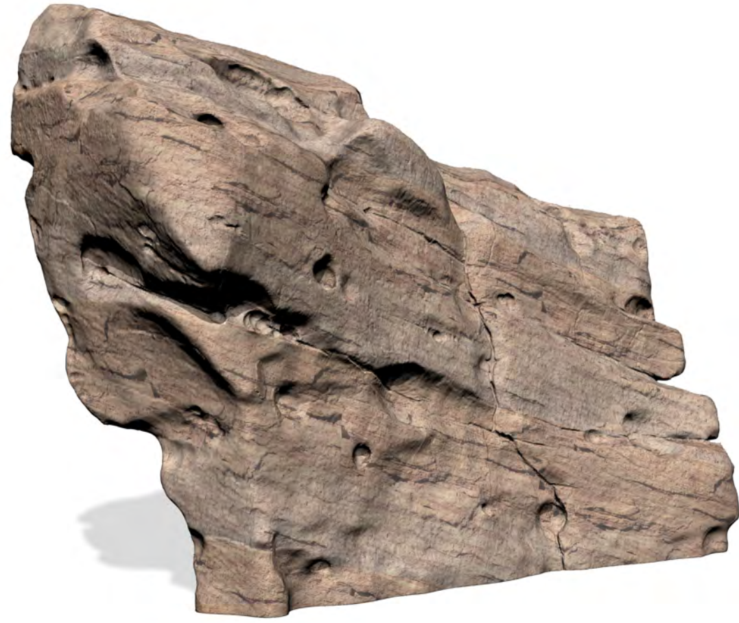
3 Palisades Boulder_CB001 (Sandstone)