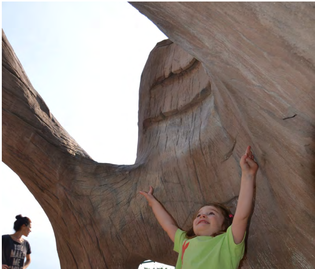
Home Tree AP004